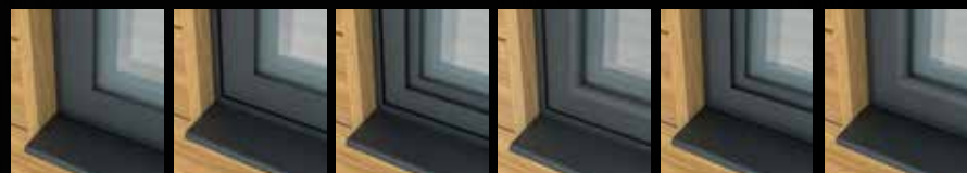
Contemporary Flush Flush Heritage Flush Softline Heritage Softline